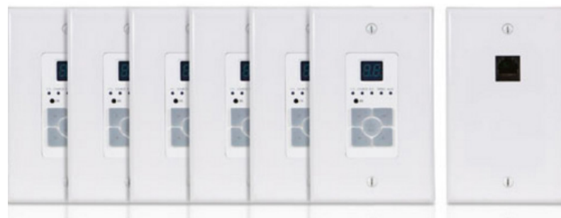
Keypad Controls and Keypad Hub Connection Plate