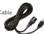
Power Cable Qty 2