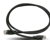
Network Cable Qty 1