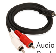
Audio Cables Qty 4