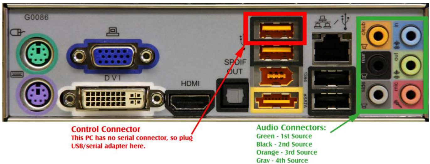
Back of typical PC, showing connector panel