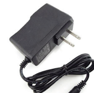
1x Power adapter