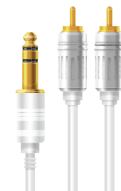
5x 3.5 mm stereo to RCA audio cables