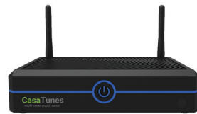
1x CasaTunes music server