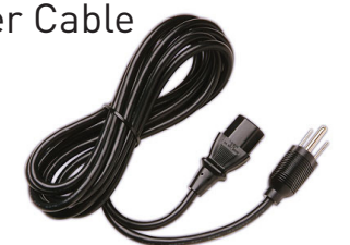
Power Cable Qty 1