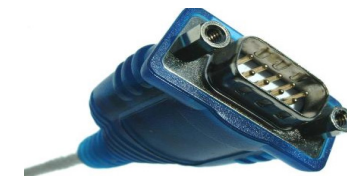
Serial Cable Qty 1