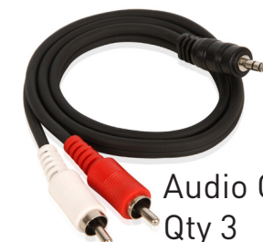
Audio Cables Qty 3