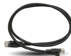
Network Cable Qty 1